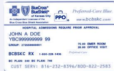
Insurance card/ form of payment