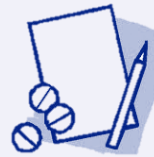
List of current medications and dose