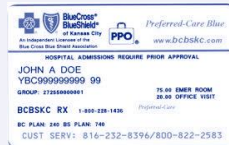
Insurance card/ form of payment