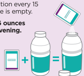
Bottles and packets not shown actual size.

IMPORTANT: If nausea, bloating, or abdominal cramping occurs, pause or slow the rate of drinking the solution and additional water until symptoms diminish.