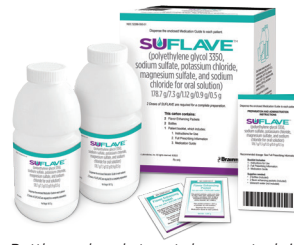
Bottles and packets not shown actual size.

To learn more about this product, please call 1-800-874-6756.