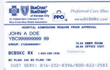
Insurance card/ form of payment