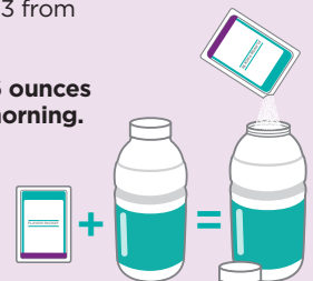
Bottles and packets not shown actual size.

IMPORTANT: Continue to consume only clear liquids until colonoscopy. Stop drinking liquids at least 2 hours prior to colonoscopy.